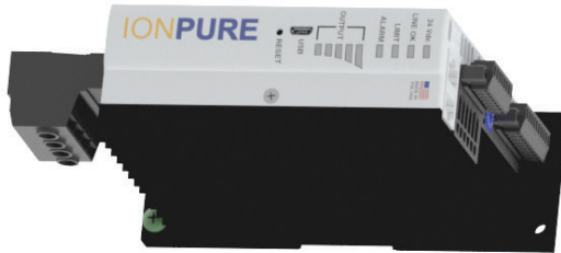
DCR Power Controller for IONPURE® CEDI