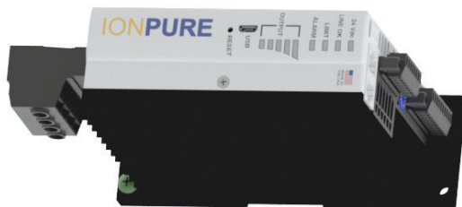
DCR Power Controller for IONPURE® CEDI