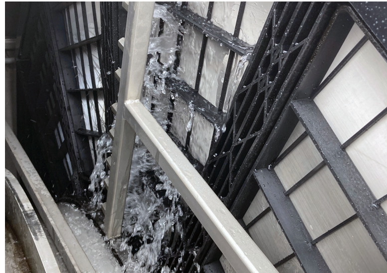
The inside-out flow of the Forty-X™ Disc Filter panels effectively captures suspended solids and adds to back-washing efficiency.

Each circular disc assembly is made up of 28 media panels. The media panels are mounted on the central influent drum to form the individual circular