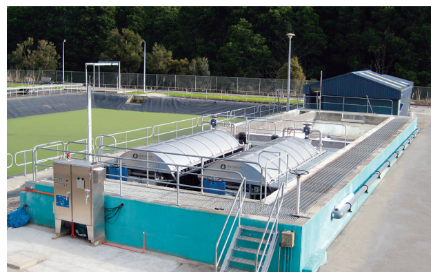
The Forty-X™ Disc Filter requires a fraction of the footprint required by traditional sand filters increasing capacity and performance

May be covered by one or more of the following patents: 7,597,805; 7,972,508; 8,118,175; 8,409,436; 8,801,929; 8,808,542; 8,961,785