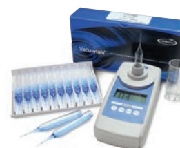
Ozone SAM Test Kit