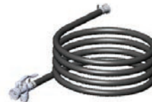
Hose and Spray Nozzle (Accessories available at evoqua.com )