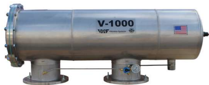
V-SERIES™ AUTOMATIC SCREEN FILTERS

Vortisand filtration systems with high-efficiency cross-flow technology reduce the build-up of fine particles responsible for fouling cooling systems, helping to keep cooling equipment running at peak performance. Cross-flow media filtration achieves submicron (0.5 micron) filtration 4 which reduces the biofouling rate to minimise heat transfer resistance, downtime, and maintenance.