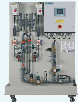
DIOX-A CHLORINE DIOXIDE GENERATOR

Chlorine dioxide generation can be based on two methods: Acid-Chlorite and Chlorine-Chlorite. In both instances, chlorine dioxide is produced as an aqueous solution with a constant strength. For the Acid-chlorite method Hydrochloric acid (HCl) and Sodium Chlorite (NaClO 2 ) are used, and for the Chlorine-Chlorite method Sodium Chlorite (24.5% NaClO 2 ) and Chlorine (Cl 2 ) gas are used. The optimal ratio of the two chemicals ensures maximum yield of chlorine dioxide.