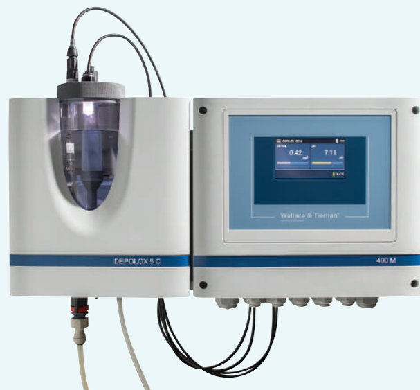
DEPOLOX® 400 M ANALYSER

of water quality parameters to ensure health, safety, and regulatory compliance. The fast and reliable systems balance the required chemicals, ensuring safe, cost-effective process water.