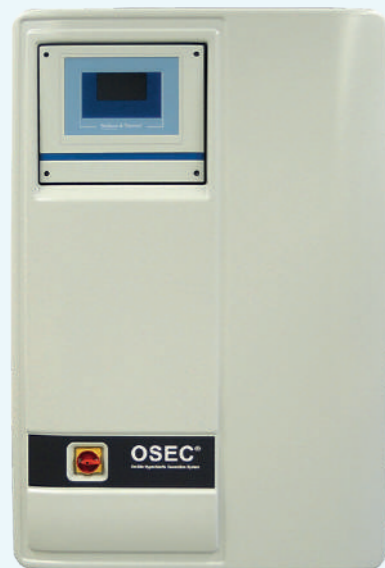
OSEC® L SODIUM HYPOCHLORITE GENERATOR

Additional operational advantages can be gained through the systems' ability to innovate by leveraging reclaimed water, plus having a hypochlorite solution at a stable concentration always available. The systems simplify disinfection storage and give greater operational flexibility when necessary.