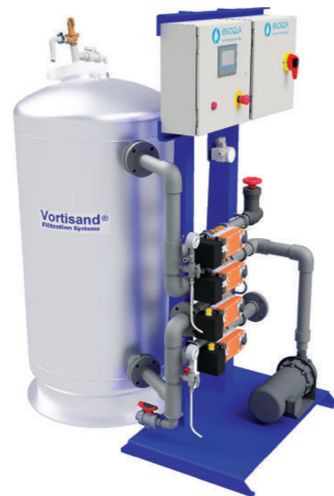
VORTISAND® SYSTEM C-SERIES

The VAF automatic self-cleaning screen filters can remove suspended solids from 1500 to 10 micron. The patented bi-directional drive design does not require electric motors, limit switches, gearboxes, or hydraulic pistons, thereby eliminating external shafts and seals.