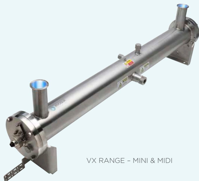
VX RANGE - MINI & MIDI

Evoqua UV disinfection generator systems undergo third-party validation testing in accordance with the UVDGM (USEPA, 2006). Validated products are tested to confirm a minimum inactivation equivalent of 3 log (99.9%) for microorganisms in accordance with NSF/ANSI 50 and the UVDGM. Performance is not claimed nor implied for any product not yet validated; unvalidated products use single point summation calculations to provide delivered dose recommendations. Performance limitations depend on feed conditions, overall installed system design, and operation and maintenance processes; please refer to Operations Manuals. For more information: Contactus@evoqua.com