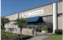
Oceanside, CA, USA Founded: 1963