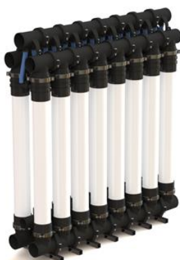
Figure 1: ZW1500-RMS 2x8 configuration

The ZW1500-RMS uses ZeeWeed membrane technology, a membrane that has been proven to meet or exceed regulatory requirements, regardless of source water quality.