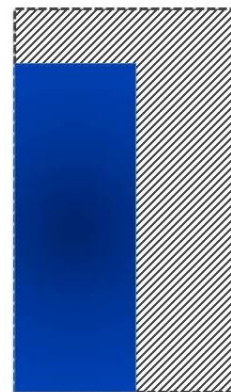
Figure 2: Blue shaded area shows the reduced footprint of the ZW1500-RMS when compared to a typical pressurized UF rack.

NOTE: ZW1500-RMS is not rated for high seismic zones. A seismic kit is available for special acceleration ratings up to 3.0g, upon request.