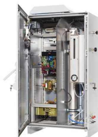
View inside: GSO 18 ozone systems