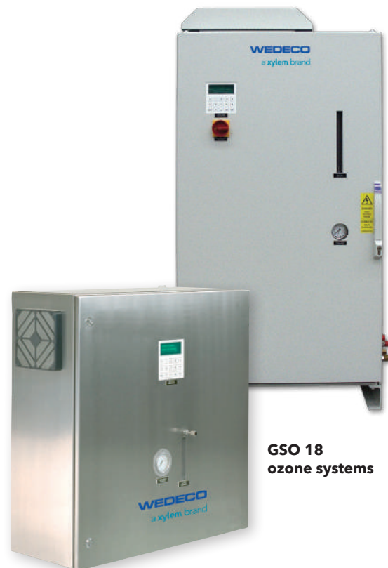
GSO 18 ozone systems