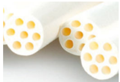
Figure 2 SevenBore membrane fiber