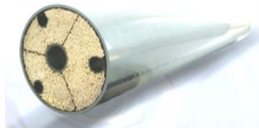
Figure 1: ZW700B-8060, horizontal

The ZeeWeed 700B-8060 (Figure 1) line of products contains our SevenBore* fiber technology with an inside-out flow orientation. The SevenBore fiber is regarded as the most robust polyethersulfone (PES) product on the market (Figure 2).