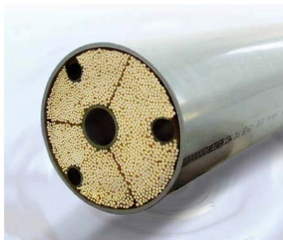
Figure 1: ZeeWeed 700B PES UF membrane

The horizontal configuration allows stacking elements in a compact fashion thereby reducing weight and space requirements. When used to pre-treat water in a sulfate removal process, the ZeeWeed 700B membrane extends the life of downstream RO or NF membranes by up to 70%, reduces maintenance requirements and provides a favorable OPEX compared to systems using conventional cartridge filters.